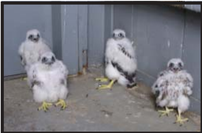
Peregrine brood in the life tower of the Benjamin Harrison Bridge ready to be